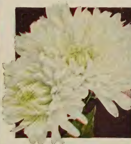
ERMINE. 60c each; 3 for $1.50